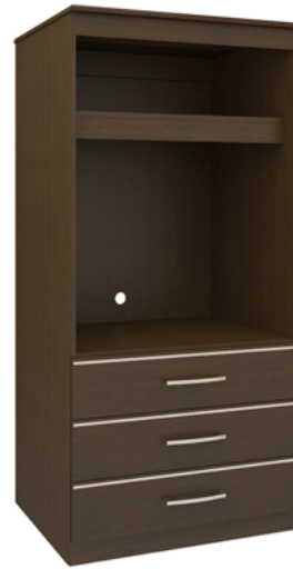
Model: HLAMTV30 35.5W 25.75D 72.25H

Defined by clean lines and sparkling 3/8" brushed aluminum inlays, Kwalu's Hollywood collection transports you to the Golden Age of American cinema. This glamorous collection includes a bedside, wardrobe, chest, headboard, footboard and so much more. Completely customizable from fit to finish.